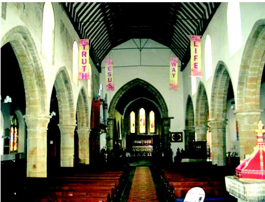
The same view in 2010. The Victorian roof timbers are exposed, but the tie beams have gone, to be replaced by iron bars. The enlarged chancel arch is now offset left and the wall around and above this are gone.

Note the box pews, extent of wall paintings and the 'doom' at the top above the small chancel arch centred to the nave, the old pulpit and tie beams. The font cover is plain, not red as at present.