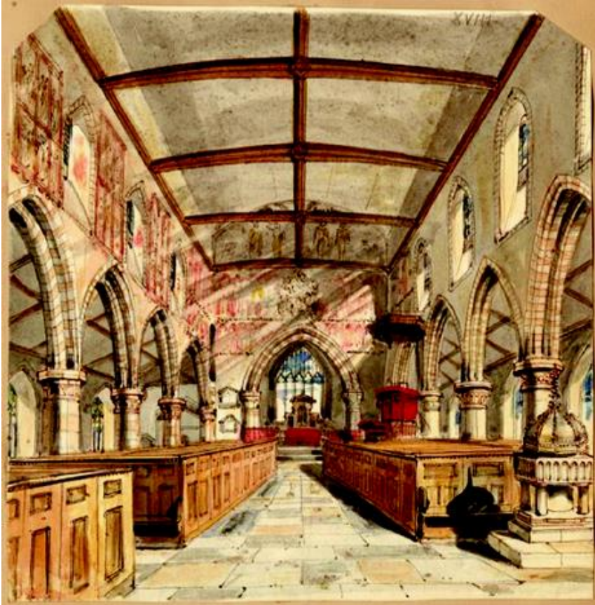
The inside of the St Mary's church viewed from the west door looking east in 1845.

Note the box pews, extent of wall paintings and the 'doom' at the top above the small chancel arch centred to the nave, the old pulpit and tie beams. The font cover is plain, not red as at present.